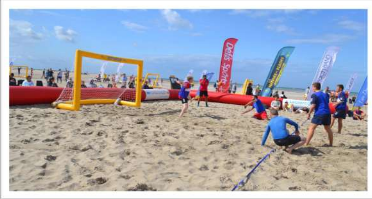
The E2C Village on the beach with free food and activities: Beach-volley, beach soccer, etc...