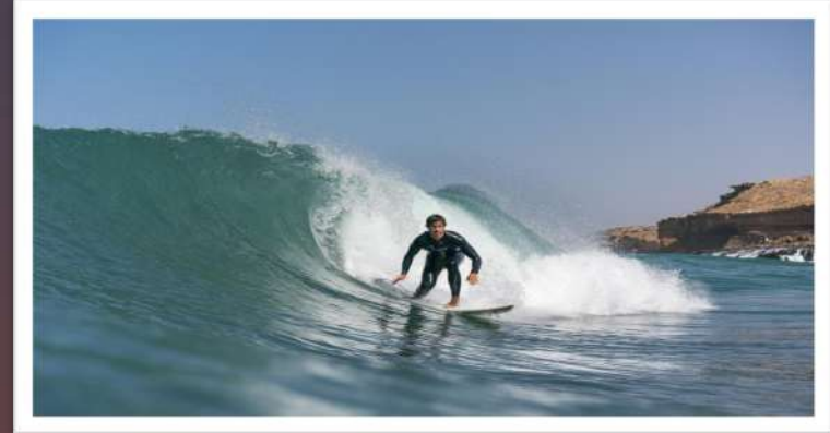
Surf sessions nearby the E2C Village