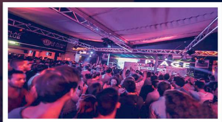
3 amazing parties