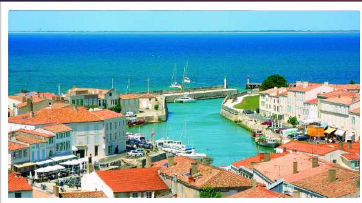
A Trip to Île-de-Ré